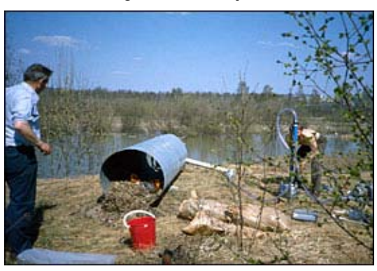
Figure 1. The experimental layout of measuring emissions from bonfires and burning of rubbish (NILU, 2003).

was burned in Norway (NILU, 2003). PAH may be formed by the thermal decomposition of any organic material containing carbon and hydrogen. More than 30 PAH compounds and several hundred PAH derivatives have been identified to have carcinogenic and mutagenic effects, making them the largest single class of chemical carcinogens known (Bjørseth and Ramdahl, 1985).