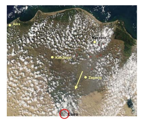
Figure 3. A satellite photo taken on 11 October 2004 shows plumes from burning of agricultural waste in the Nile Delta. The wind transported the plumes towards the city of Cairo.

Measurements of suspended particles in Cairo were undertaken during the season when rice waste and other agricultural waste were burned in the Nile Delta. Measurements in Cairo was taken downwind from these sources, and it has been shown that the burning of waste contributed considerably to the general air pollution load in Cairo, several tens of kilometres downwind (Sivertsen and Dreiem, 2004)