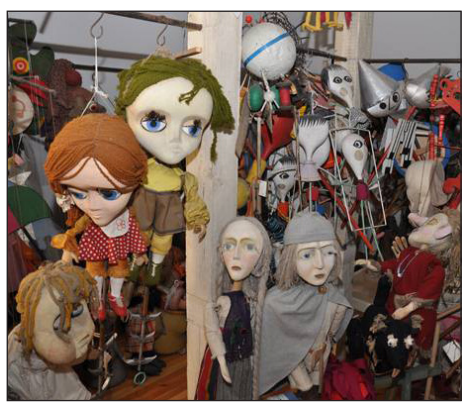
Fig. 2. The Lithuanian Theatre, Music and Cinema Museum is one of the End-users in the MEMORI project.

Connected to the MEMORI dosimeter and reader, a software and a web based system are designed to visualize and interpret the results from the reader.