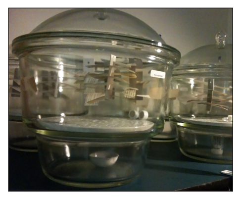
Fig. 3. Accelerated ageing of cellulosic materials exposed to acetic acid in the laboratory at NILU.